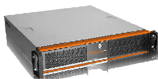
VideoCenter III 19" Rack