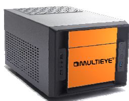
VideoCenter III Desktop